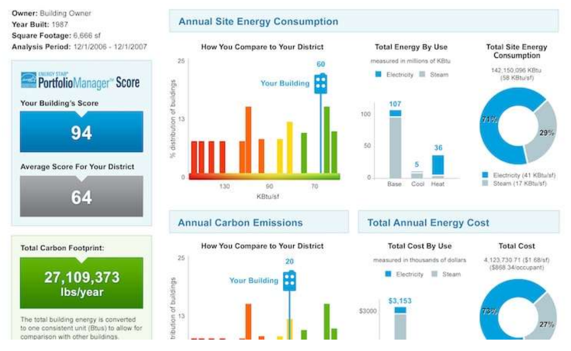
Figure 3 Energy Star Portfolio Manager Portal

In other country like USA, there is a common energy use benchmarking named Energy Star Portfolio Manager to rate the buildings energy performance. The ENERGY STAR score compares the building's energy performance to similar buildings nationwide, normalized for weather and operating characteristics. The performance is measured on the scale of 1 to 100 and through the Energy Use Intensity (EUI). A higher score of Energy Star is better and lower is worse. Similarly, Higher the Energy Star Score, lower the EUI.