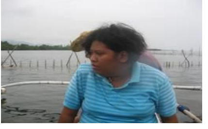
Figure Number 3. On-site Observation.

*Emancipator research is a research perspective of producing knowledge that can be of benefit to disadvantaged people. It is an umbrella term that can include many streams of critical theory based research such as feminist, disability, race and gender theory(https://www.google.com.ph/ search?q=emancipatory+paradign&rlz=1C1GIGM_en PH755PH755&oq=emancipatory+paradign&aq s=chrome.69i57.7064j0j4&sourceid=chrome&ie=UTF-8.)