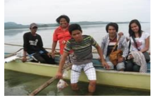
Figure 5. In the site with the help of research enumerators.