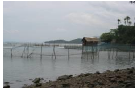
Figure Number 4. The fish cage on the site.