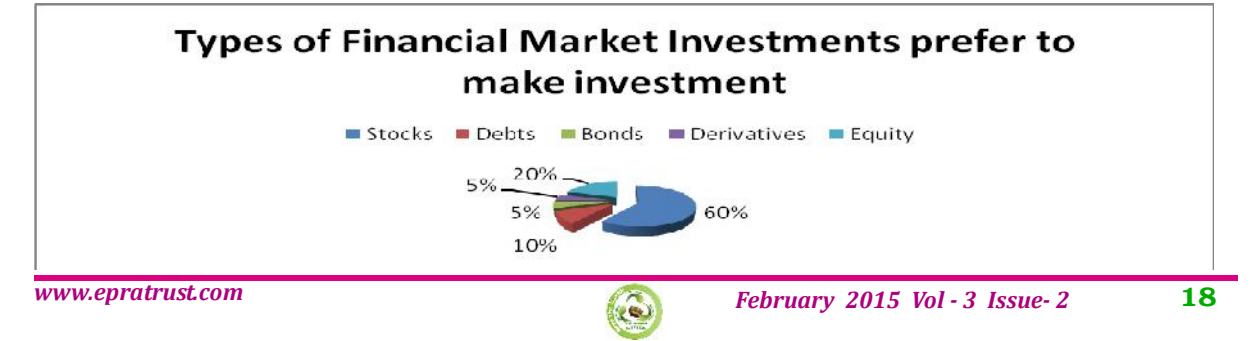
Chart 2: Showing the details of the type of financial market prefer to make investment

aware about Financial Markets. Only 37.5 % of the respondents were unaware about financial market investments.