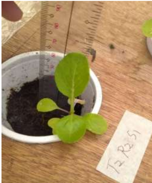
Plate 1. Measuring the Pechay Height at 15 and 30 days after transplanting.