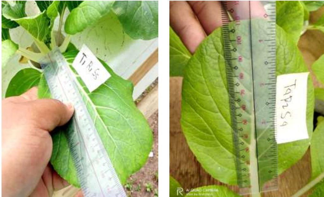
15 Days after Transplanting Width of Leaves

The result of a study showed a significant effect on the width at 30 days after transplanting while there was no significant effect at 15 days after transplanting using vermitea and nutrient solution under a non-circulating hydroponic system.