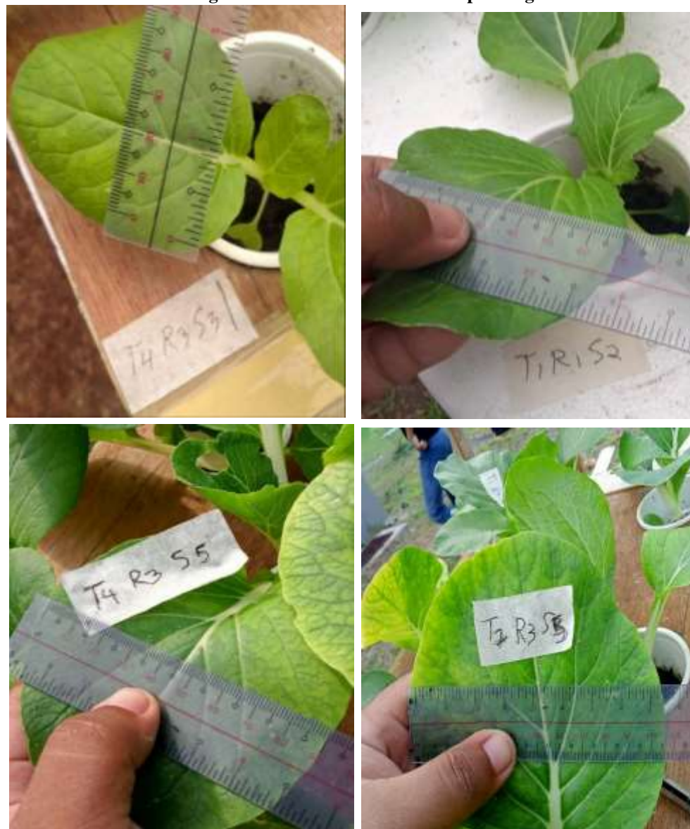
Average Weight per Plant