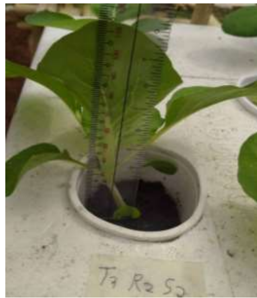
15 Day after Transplanting