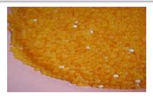
Figure 2. White (dead) caviar to be removed.

Volume: 10| Issue: 1| January 2024|| Journal DOI: 10.36713/epra2013 || SJIF Impact Factor 2023: 8.224 || ISI Value: 1.188