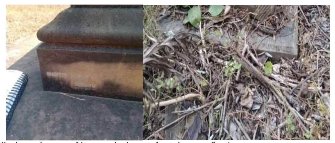
Following are the names of the companies that manufactured graves at Jhansi.

The multitude of sepulchers is contrived by stone, but few are made of marble also. At this place, the exclusive aspect is that most of the graves bear the pattern of a crossed shape either on a headstone or on the mass design of the grave. The names of the companies involved in the manufacturing of graves are Suntoke & co. Agra, Purshadee, and Martin Sculp Company of Lucknow, etc.