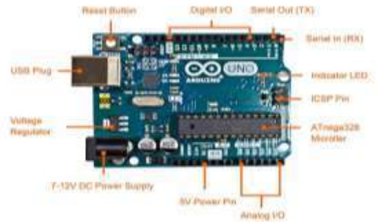
Fig.2 Arduino UNO Controller Board

Arduino Uno is an open source physical computing platform used for building digital devices and interactive objects that can sense and control objects in physical world. It's a micro controller, based on AT mega 328P which consist of 14 digital input/output pins (out of which 6 pin are used as PWM output), 6 analog inputs, a USB connector, 16 MHz quartz crystal, power jack, and a reset button. Arduino IDE (Integrated Development Environment) is used to upload programs to the arduino boards and that can be used to perform intended tasks. In this application, the arduino is programmed in such a way that it takes control of flight of the smoke jumper as well as operation of gripper.