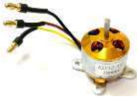
Fig.4 BLDC Motor