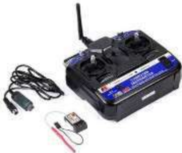
Fig.6 6 Channel Transmitter and Receiver

Radio transmitter uses radio signal to remotely control the smoke jumper in wireless way, the commands given by transmitter are received by a radio receiver connected to arduino. The receiver selected operates on 2.4GHz of radio frequency. The number of channels in transmitter and receiver determine how many actions of aircraft can be controlled by pilot. Here, we are using six channel transmitter and receiver. Minimum of four channels are enough to control the flying unit. The remaining two channels are for the control of servo motor gripper.