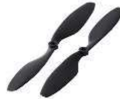
Fig.8 Carbon Propellers

10 inch carbon fiber propellers were used to keep it light weight.