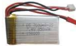
Fig.7 Li-Po Battery

discharge rates required to meet the need of powering the smoke jumper.