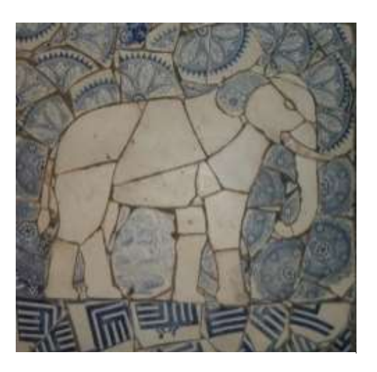
Figure No. 09 Figure of Tusker