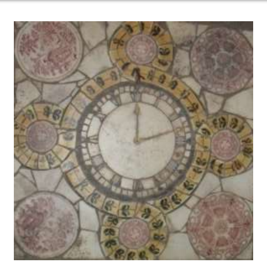
Figure 08 Figure of Clock