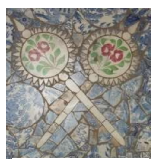
Figure 05 Figure of Sesath