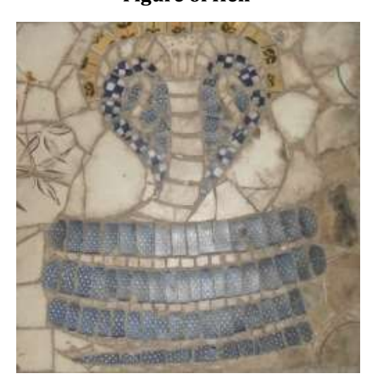
Figure 17 Figure of Snake