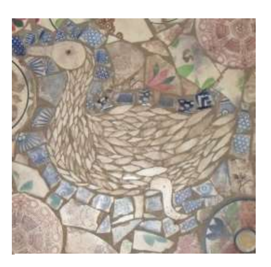
Figure 16 Figure of Duck