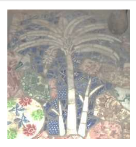
Figure 02 Figure of Banana trees