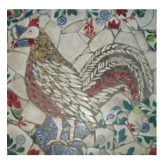
Figure 15 Figure of Hen