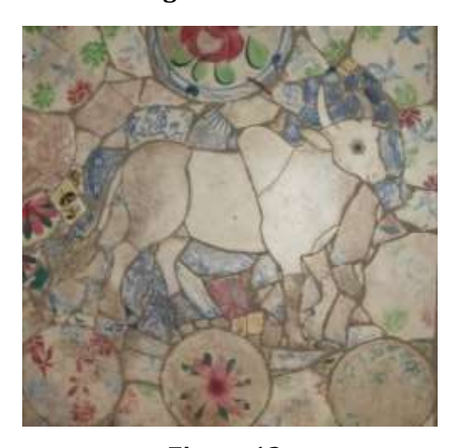
Figure 12 Figure of Bull