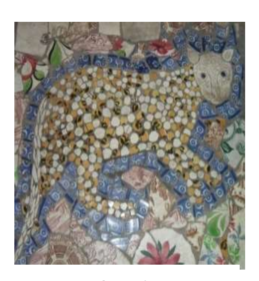
Figure 14 Figure of Leopard