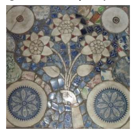
Figure 03 Figure of Lotus Flowers