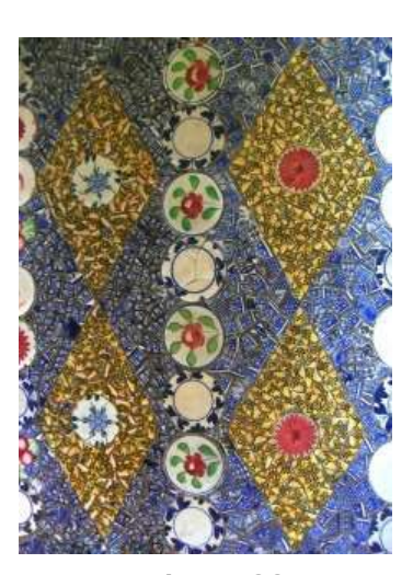
Figure 22 Mosaics at Sathsathige