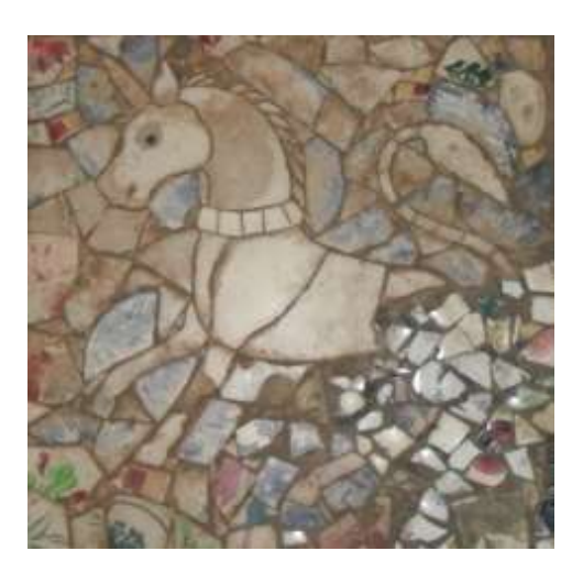
Figure 13 Figure of Unicorn