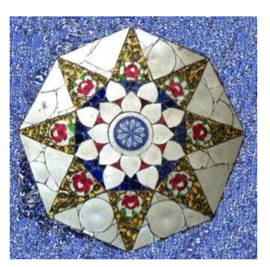
Figure 21 Mosaics at Sathsathige