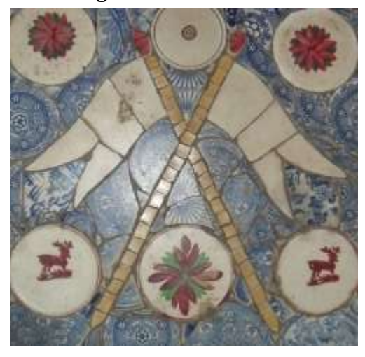
Figure 04 Figure of Flags