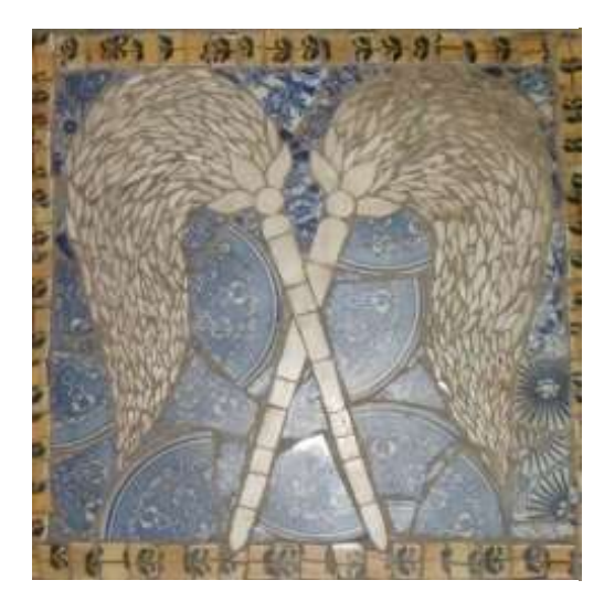
Figure 06 Figure of Chamara