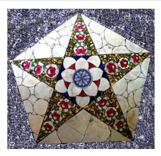
Figure 19 Mosaics at Sathsathige