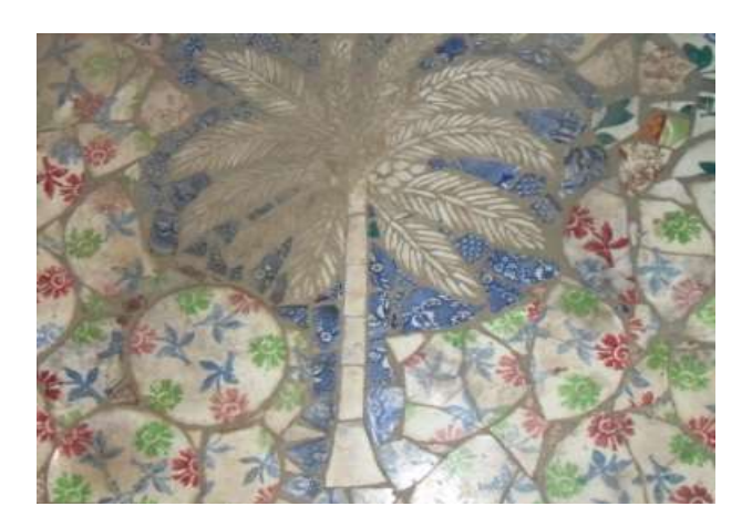
Figure 01 Figure of tree - Plam species (Coconut tree?)