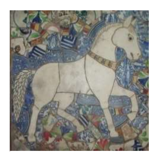
Figure No. 10 Figure of Horse