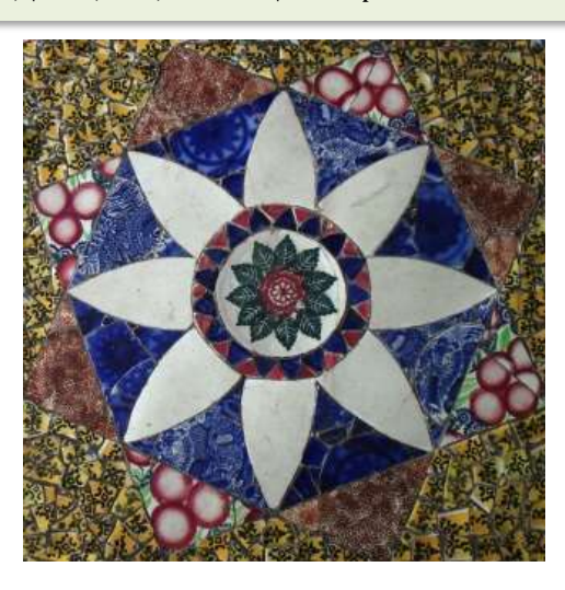
Figure 20 Mosaics at Sathsathige