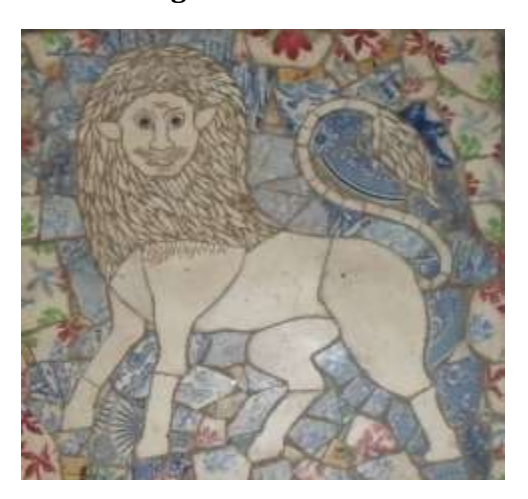
Figure 11 Figure of Lion