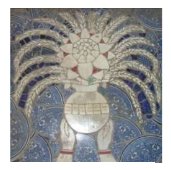
Figure 07 Figure of Prosperity Pot