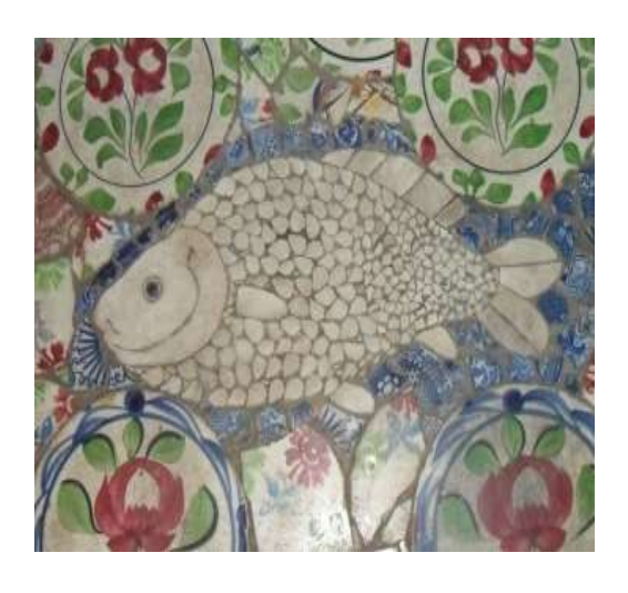
Figure 18 Figure of Fish