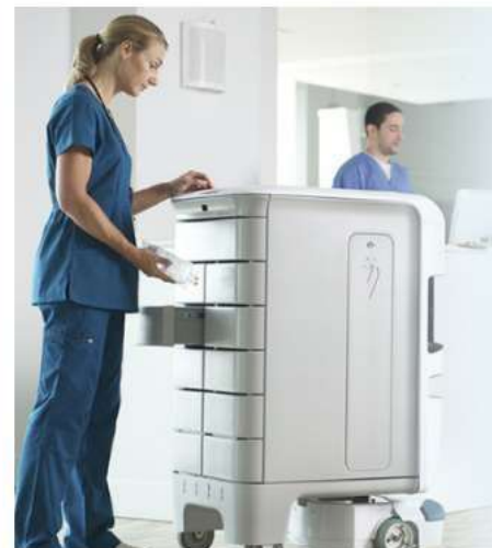
Fig. Tug Robot