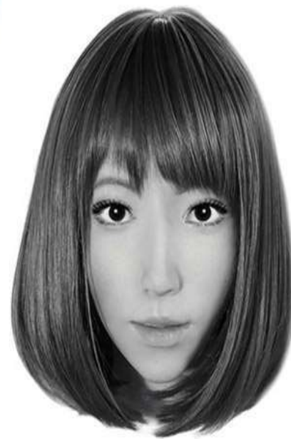
Fig. Erica Robot