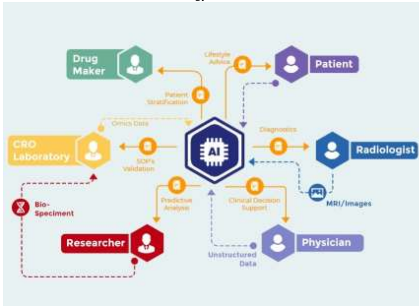
Fig. AI used in Pharmacy

the preparation and tracking of medications. According to them, the technology has prepared 3, 30, 000 medication doses without any core The robot has proved to be far better than humans both in size as well as its ability to deliver accurate medications. The abilities of the robotic technology include preparation of oral as well as injectable medicines which include chemotherapy drugs that are toxic. This has given freedom to the pharmacists and nurses of UCSF so that they can utilize their expertise by focusing on direct patient care and working with the physicians