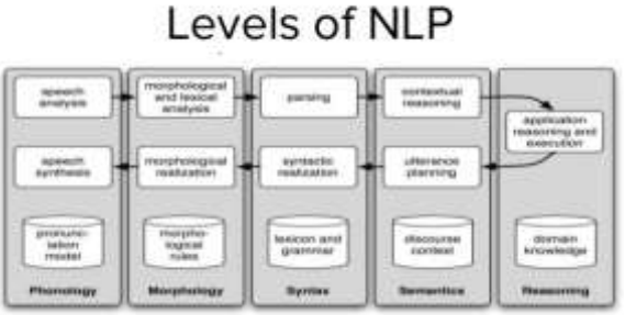
Fig. 1. Different Level of NLP.

To know how Natural Language Processing sytem work is by means of the 'levels of language' approach. It is also known as the synchronic model of language and is distinguished from the earlier sequential model, which hypothesizes that the levels of human language processing follow one another in a strictly sequential manner.