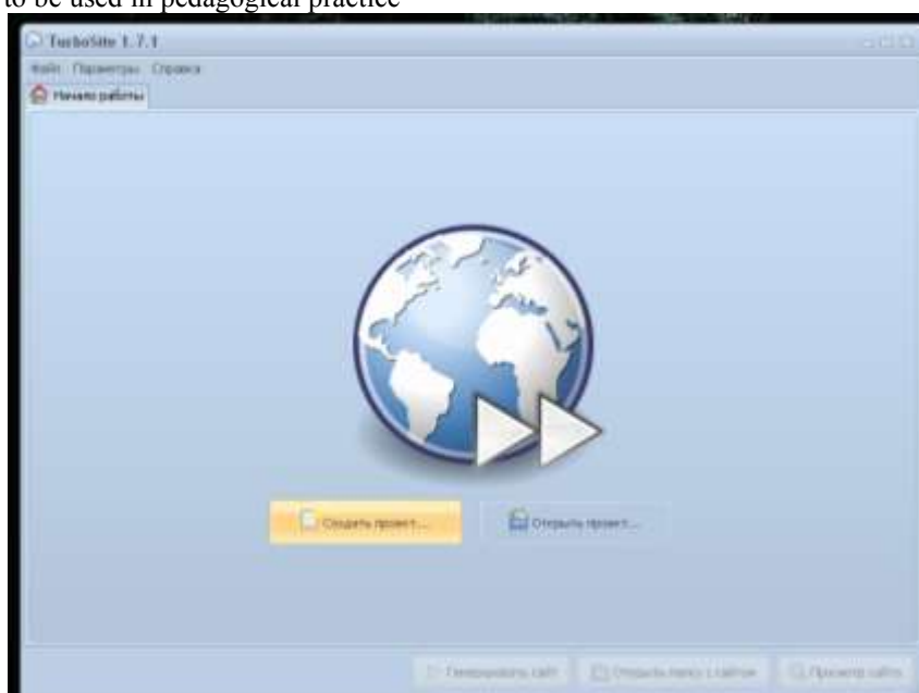
Picture 1. Sequence of project creation in turbosite program.