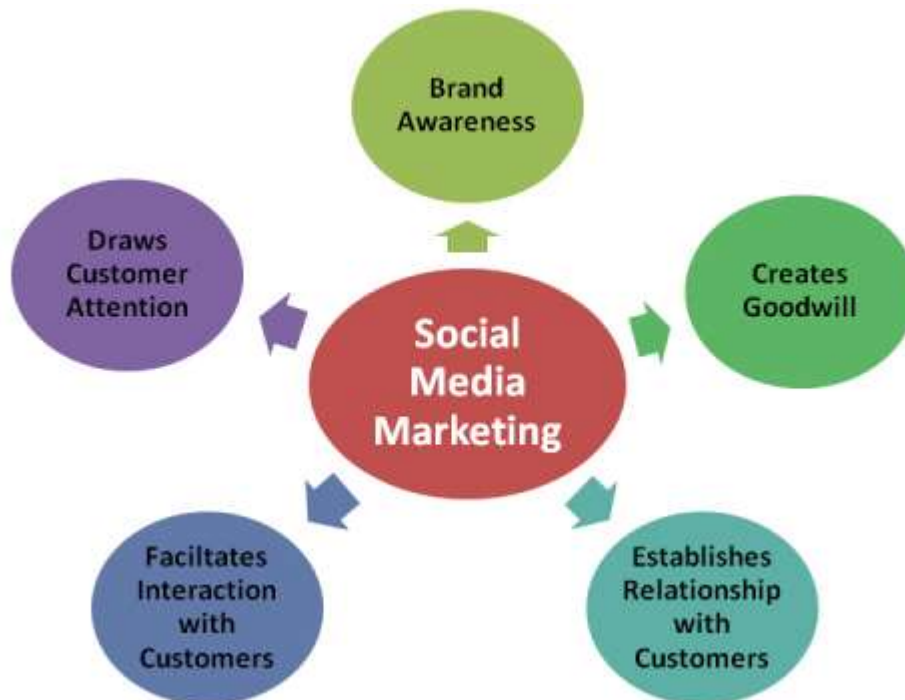
Figure 1. Social media marketing