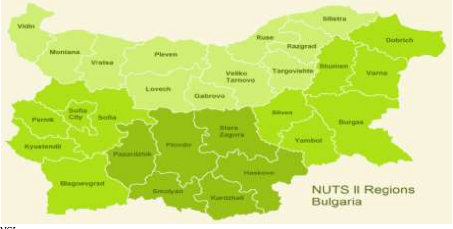
Figure 2. NUTS II Regions of Bulgaria

district (226 thousand d.), Montana district (127 thousand d.) And Vidin district (82 thousand d.), Form the Western planning region. , Northern planning region form, Vratsa district (159 thousand d.), Pleven district (236 thousand d.), Lovech district (122 thousand d.), Veliko Tarnovo district (232 thousand d.), Gabrovo district 106 thousand e), Razgrad district (110 thousand e) and Ruse district (215 thousand d.), - Northeastern planning region to include the districts of Silistra (108 thousand d.), Dobrich (171 thousand d.), Varna (469 thousand d.), Shumen (172 thousand d.) And Targovishte (110 thousand d.). ), Southeastern planning region to include the districts of Haskovo (225 thousand d.). Stara Zagora (313 thousand d.), Sliven (184 thousand d.), Yambol (117 thousand d.) And Burgas (409 thousand d. . d.), and the Southern planning region includes the districts of Plovdiv (666 thousand d.) Pazardzhik (252 thousand d.), Pernik (119 thousand d.), Kyustendil (116 thousand d.), Blagoevgrad (302 thousand thousand), Smolyan (103 thousand) and Kardzhali (158 thousand).