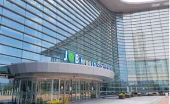
Figure 3. Jop World Center in Korea [4].

The natural climate is of great importance for the design of the innovation center at the level of demand. In the context of Uzbekistan, first of all, a proposal has been developed to build an innovation center in areas with temperate climates.