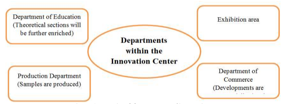
Figure 1- Functional departments of innovation centers

By designing separate buildings and experimental rooms in each direction, broad opportunities will be created for young people to apply innovative ideas. Interest, motivation and results motivate young people to strive for innovation and creativity. The study of developed countries shows that the innovation center for the development of the state has risen to the level of public policy, along with theoretical knowledge, practice is required of young people at the same time [2].