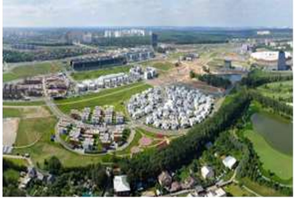
Figure 2. Skolkovo Innovation Center in Russia [3].

Founded on May 15, 2012, Jop World in Korea is the largest work experience center for children and adolescents in Korea. As a place where students can enhance their self-management career skills by taking opportunity a variety of work experiences, Jop World in Korea has such a buzz that some even call it a "magic box". During the free