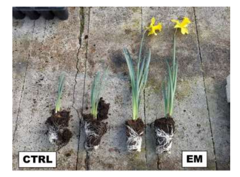
Figure 2 - Comparison between Effective microorganisms (EM) and control on vegetative and roots growth of Narcissus

multiple-range test (P = 0.05).Legend: (CTRL): control; (EM): Effective microorganisms; (BAC1): TNC Bactorr<sup>s13</sup>; (BAC2): Tarantula powder Advanced nutrients