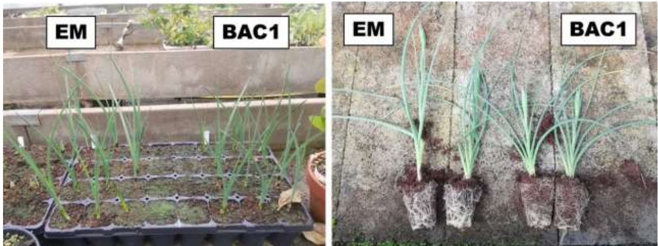
Figure 4 – Comparison between of Effective microorganisms (EM) and beneficial microorganisms (BAC1) on vegetative and roots growth of Freesia