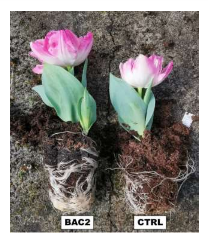
Figure 3 - Effect of beneficial bacteria (BAC2) on roots growth of Tulip