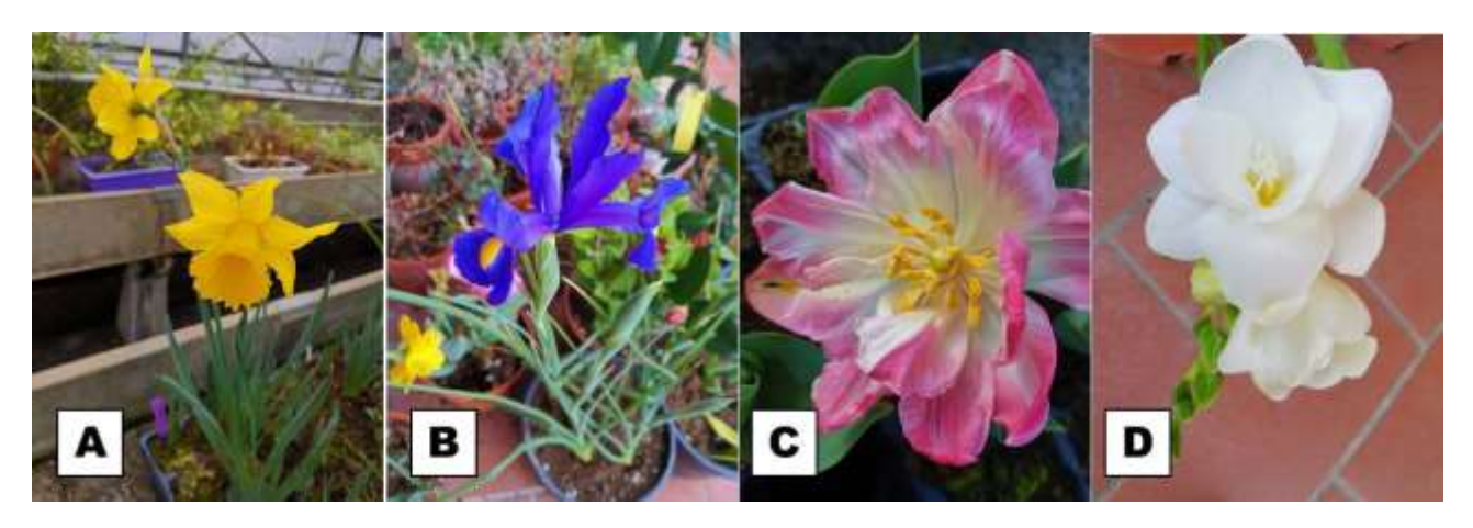
Figure 1 – Particulars of Narcissus (A), Iris (B), Tulip (C) and Freesia (D) flowers

The aim of this work was to use Plant growth promoting rhizobacteria (PGPR) for the improvement of cultivation and agronomic and pathogen protection characteristics of ornamental bulbous plants such as tulip (fam. Liliacee), Iris (fam. Iridacee), freesia (fam. Iridacee) and narcissus (fam. Amarillidacee) (Figure 1).