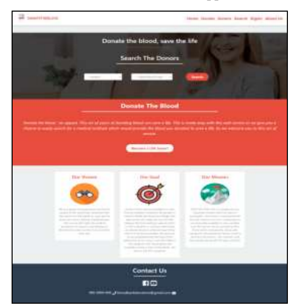
Figure 1: Home Page

The various screenshots of various activities from the application are shown below: