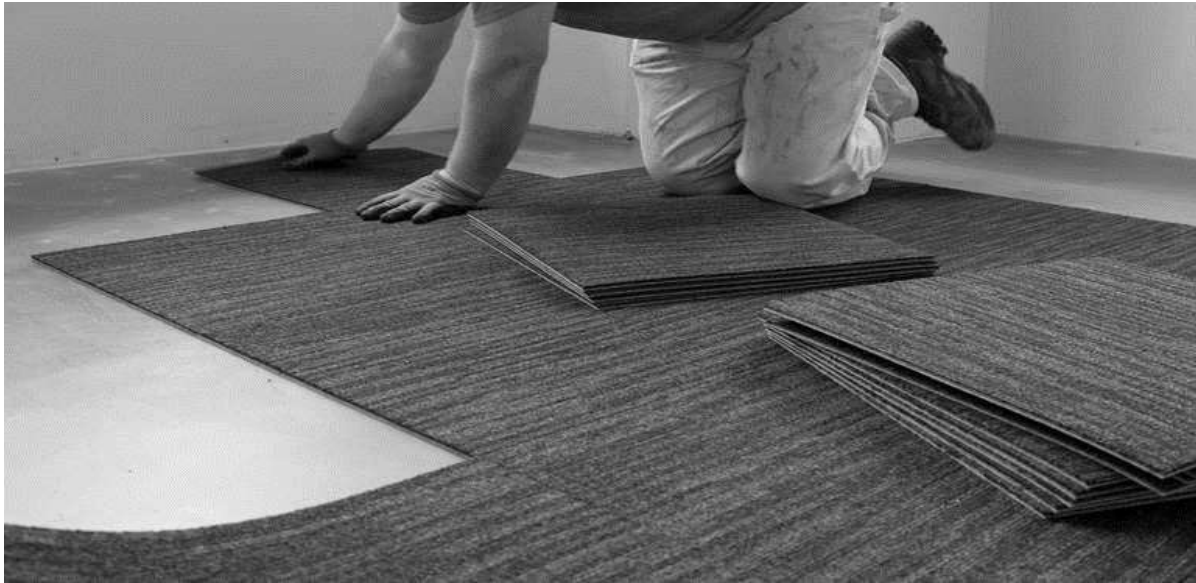
Figure 3 CARPET TILE INSTALLATIO