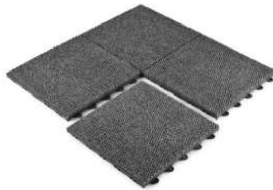
Figure 2 INTERLOCKING CARPET TILES

These carpet tiles are 4 times more efficient as compared to broadloom carpet. Modular tiles are not only easy to fit, they are much easier to store.