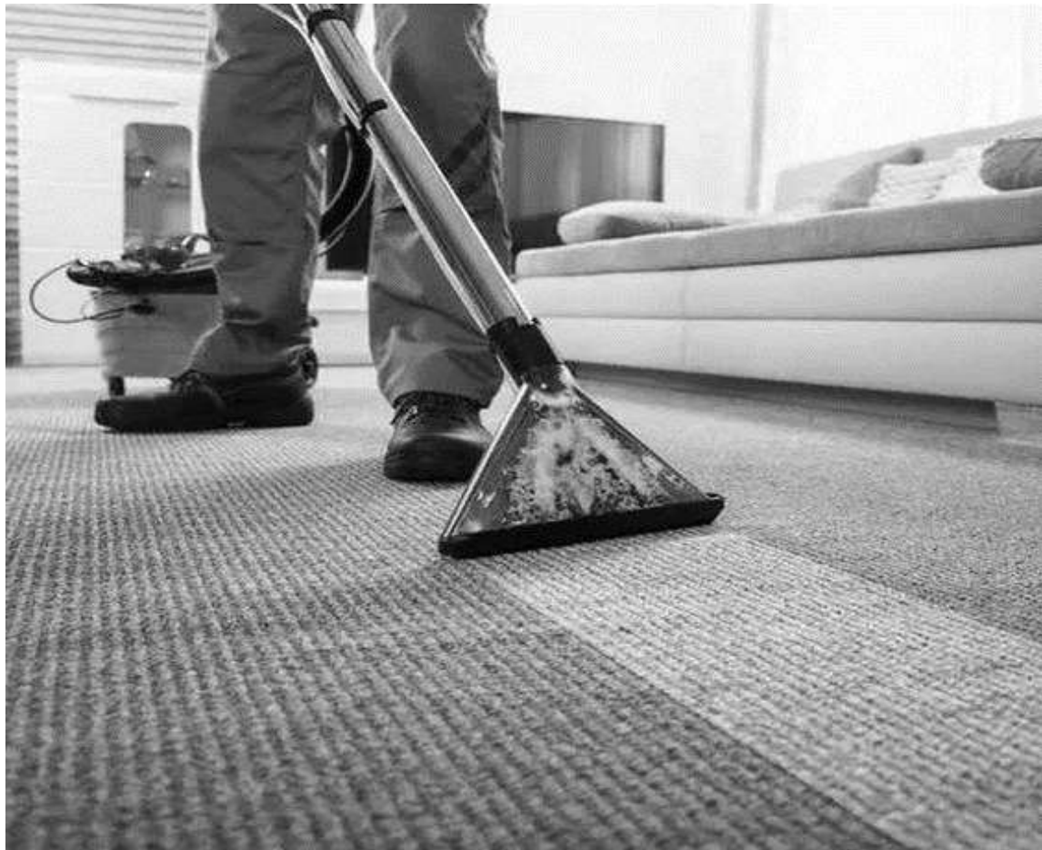
Figure 7 CARPET TILE CLEANING