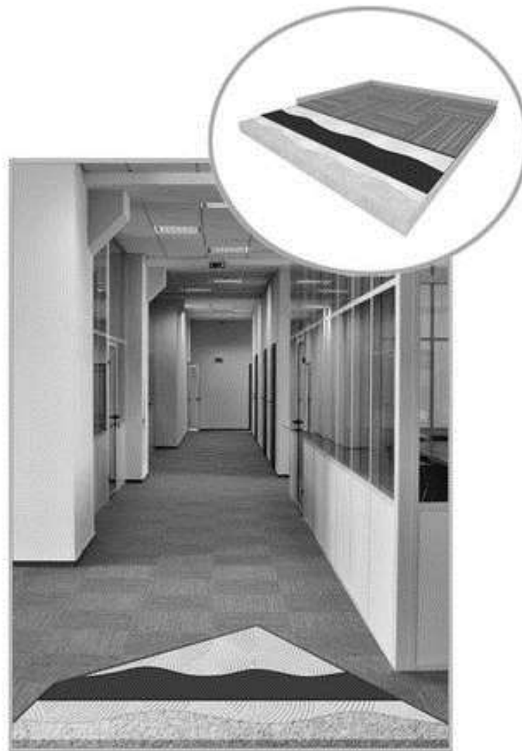
Figure 6 DESIGN OF CARPET TILES AS PER ACOUSTICS

Soundproofing flooring is the ideal solution for reducing the impact of noise in any space, and at Interface, we design our products with acoustics in mind.