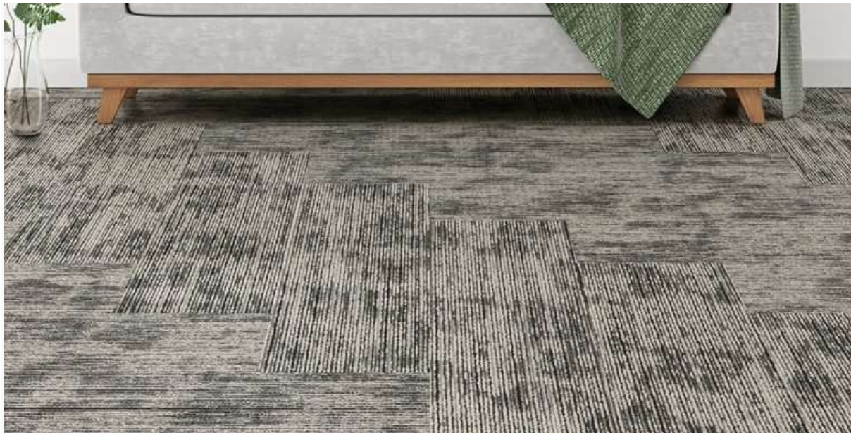
Figure 1 CARPET TILES