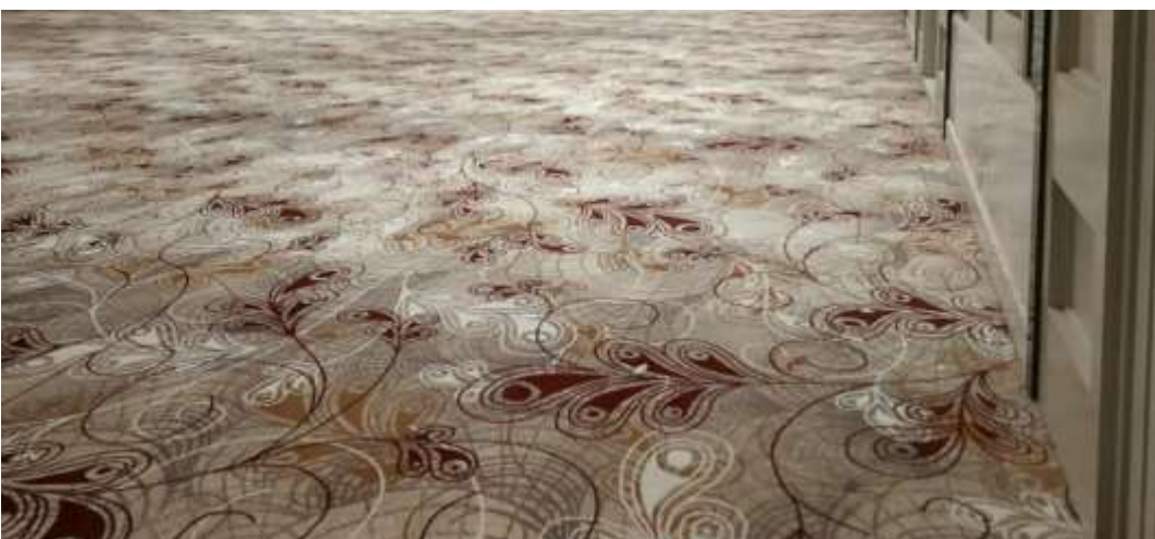
Figure 8 JW MARRIOTT HOTEL BANQUET HALL, JAIPUR