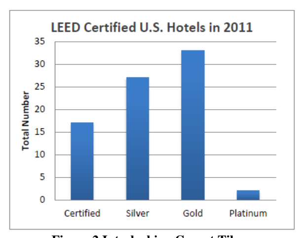
Figure 2 Interlocking Carpet Tiles

Volume: 7 | Issue: 7 | July 2021|| Journal DOI: 10.36713/epra2013 | SJIF Impact Factor 2021: 8.047|| ISI Value: 1.188