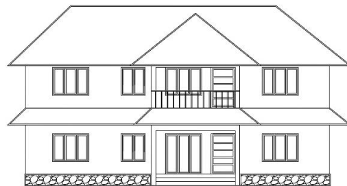
Fig 1. Elevation of the proposed building

The assessment of green building rating is to be conducted for a proposed residential building in Kerala. The building design is proposed based on the conventional practices in the region.