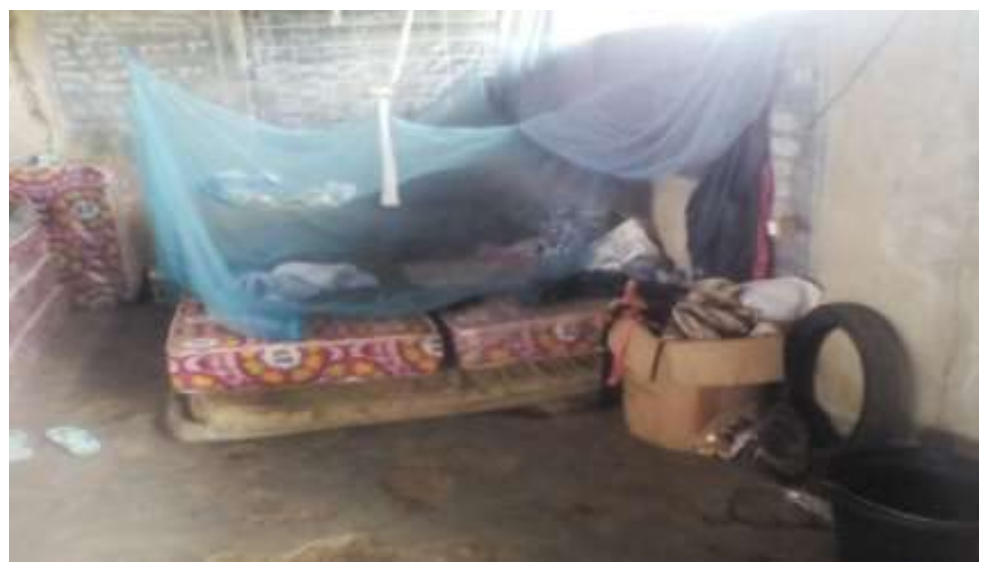
Figure 2: Pictures showing IDPs place of living

Location: Akwa Ikot Eyo Edem, Akpaboyu, cross river state; (Source: field survey, 2016)