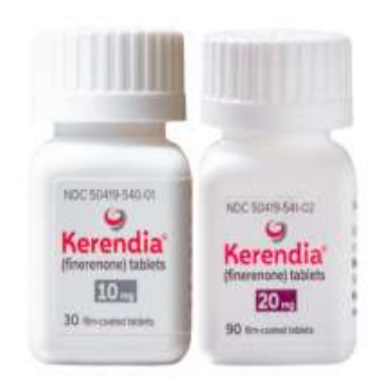
Finerenone (Kerendia) 10,20 mg