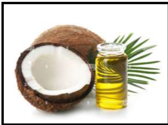
Fig. 4: Coconut Oil