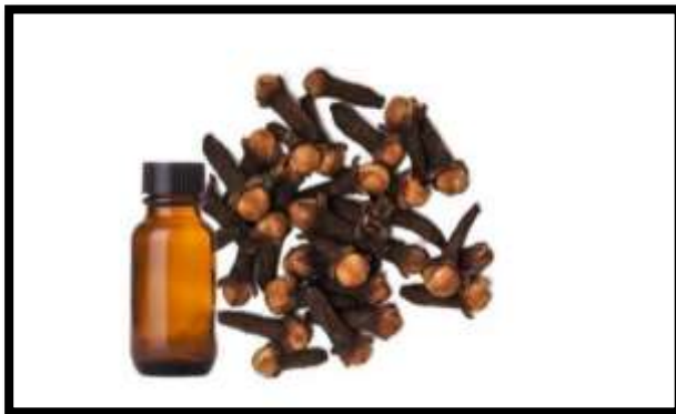
Fig.7: Clove oil