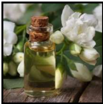
Fig.8: Mogra oil