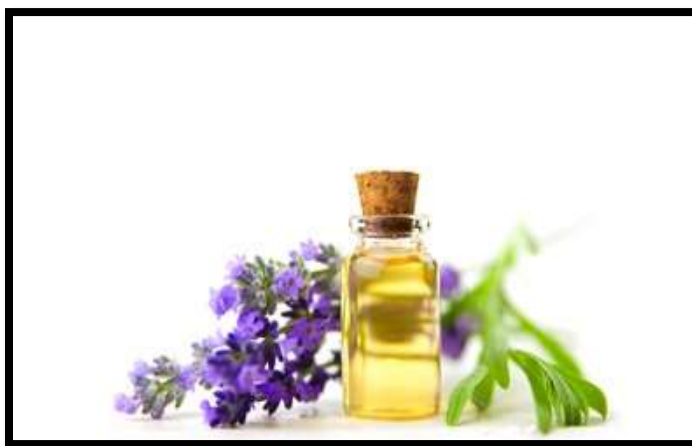
Fig.6. Lavender Oil