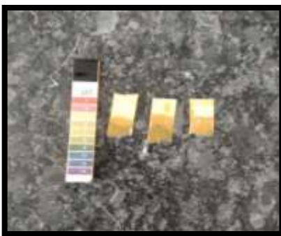
Fig.9: Determination of pH

The pH of formulation was determined using digital PH paper.