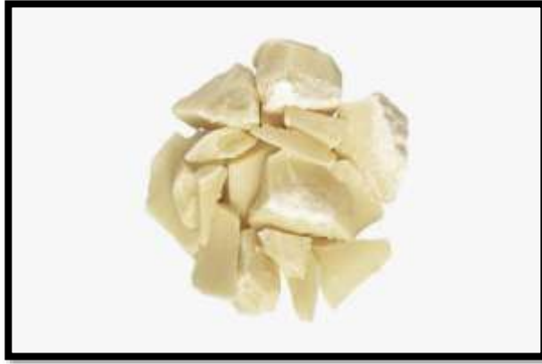
fig.2: Cocoa butter