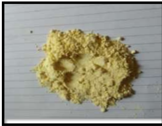
Fig.3. Corn starch