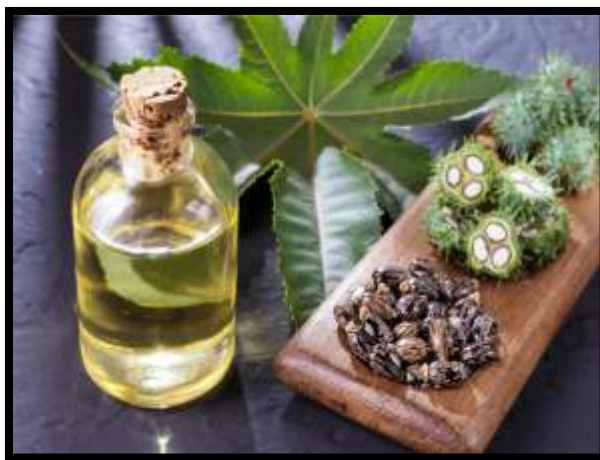
Fig.5: Castor oil