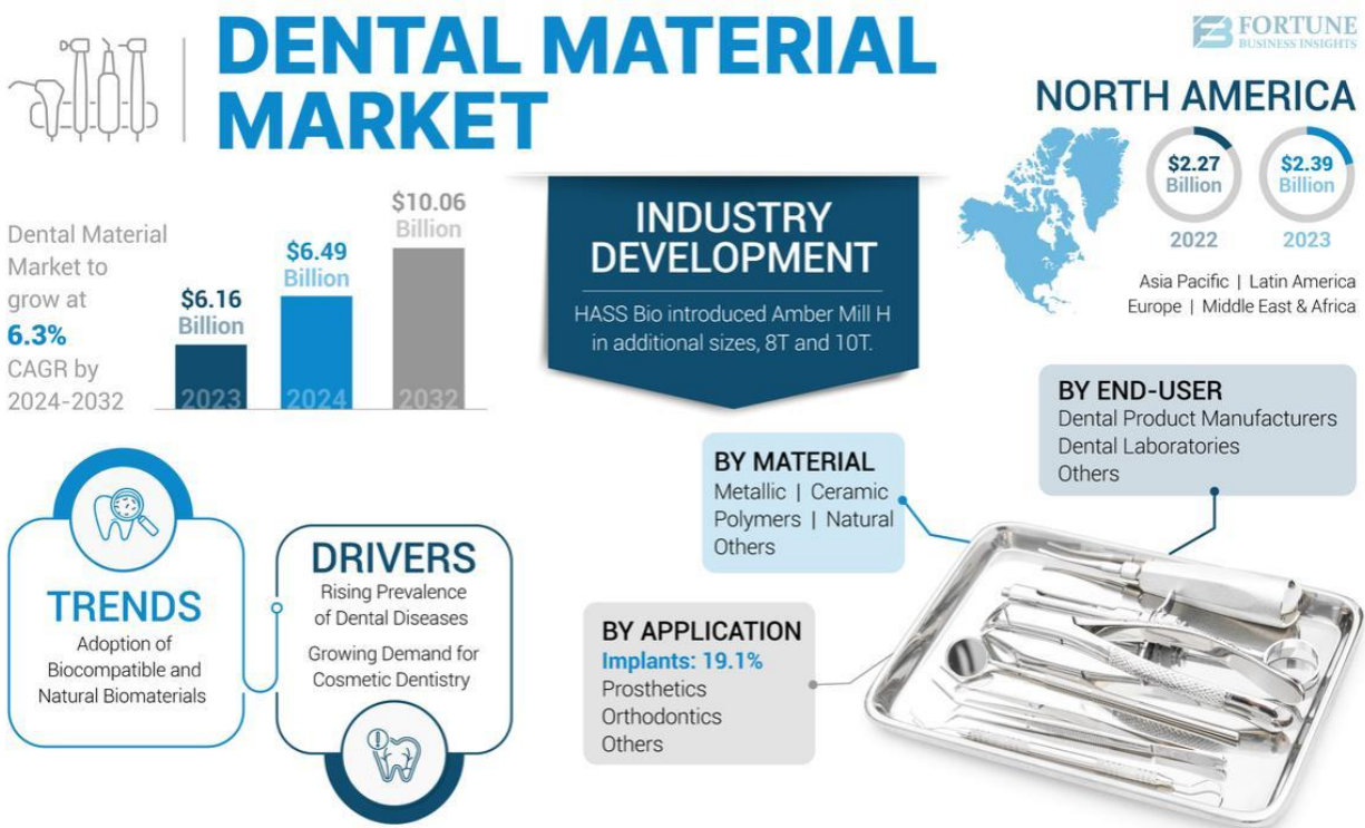
Fig:1. Dental Product Market.

The global dental products market has experienced significant growth over the last few decades. As oral health awareness has increased worldwide, the demand for dental care products has surged, leading to advancements in both the products available and the ways in which they are marketed. The market for dental products includes a wide range of items such as toothbrushes, toothpastes, mouthwashes, dental floss, therapeutic dental products, implants, and orthodontic materials. These products serve to prevent oral diseases, improve hygiene, and offer restorative solutions.