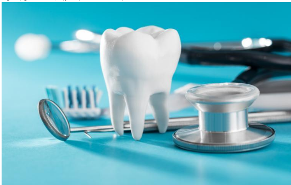
Fig:2. Emerging trends in the Dental Market