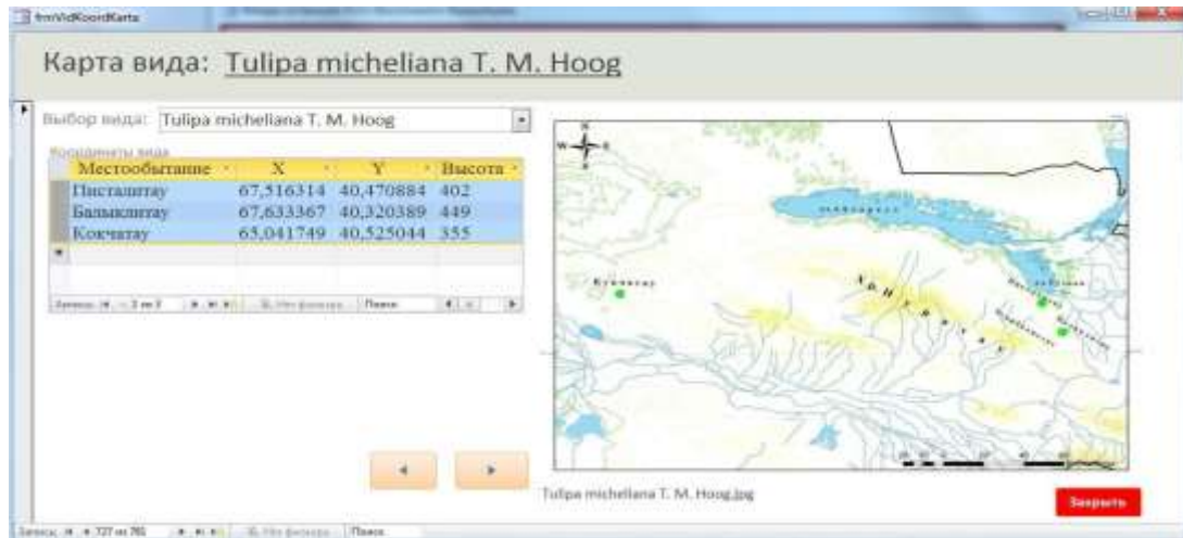
Fig. 1.3. Information on geographical coordinates and species distribution maps

So far as over the past century many toponyms have repeatedly changed, the historical maps from the TASH archives were truly invaluable in this work. The coordinates were entered into the table in Microsoft Excel format, imported into the GIS using the ArcGIS 10.0 program, and saved as vector layers with collection points for herbarium samples (GIS shapefiles). Licensed ArcGIS was obtained through sponsorship of the GEF Small Grants Program. Satellite images from open Internet resources (Google, Yandex, etc.) exported to GIS using the SAS Planet program, as well as vector and raster layers from an open Internet resource ( www.naturalearthdata.com ). To create view distribution maps from ArcGIS, the data was imported into a jpg image file.