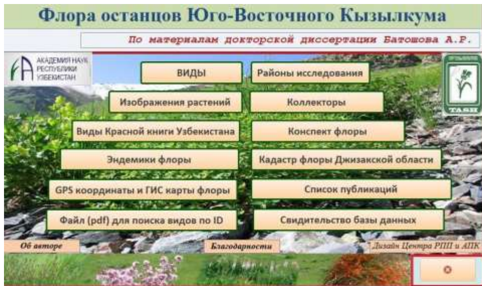
Fig. 1.1. Database Cover Page

Below information is given on detailed structure and functionality of the database on the flora of the relics of Southeast Kyzylkum. The database consists of 11 sections (windows): types, images, species of the Red Book of the Republic of Uzbekistan, endemic flora, GPS coordinates of collections by species and GIS map, information about the research area, collectors, data on the cadastral flora of vascular plants of Jizzakh region, a list of publications on dissertation topic and species search by ID (Fig. 1.1)