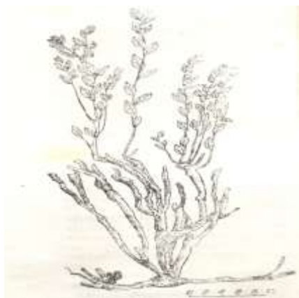
Fig-3. Root seedling P. ariana dode

with stem cuttings. To do this, cut stems 35-40 cm long and planted along the canal in the amount of 100 pieces. It should be said that the reproduction is very low, totaling 16%. The broadest reproduction is propagation by root offspring. Root-offspring propagation mainly occurs in the valleys. So in the Jackal tugai of the Nukus forestry on an area of 8 m<sup>2</sup>, 75 root offspring were recorded. P. ariana Dode is also found in household plots, among turangilic thickets where melons and gourds are cultivated (Fig-