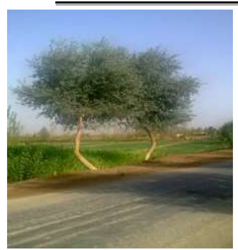
Figure 1: General view of P. Ariana

Volume: 5 | Issue: 10 | October 2020 - Peer Reviewed Journal