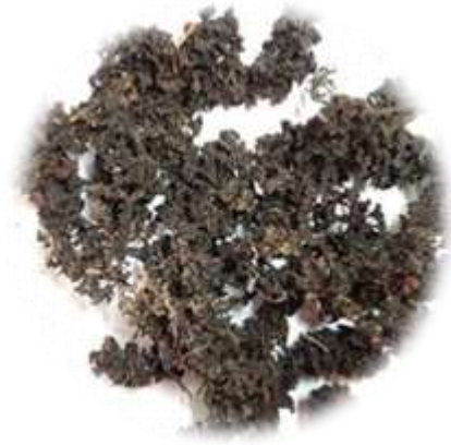
Plate: 6 Turbinaria conoides

Species : Turbinaria conoides ( J. Agardh)