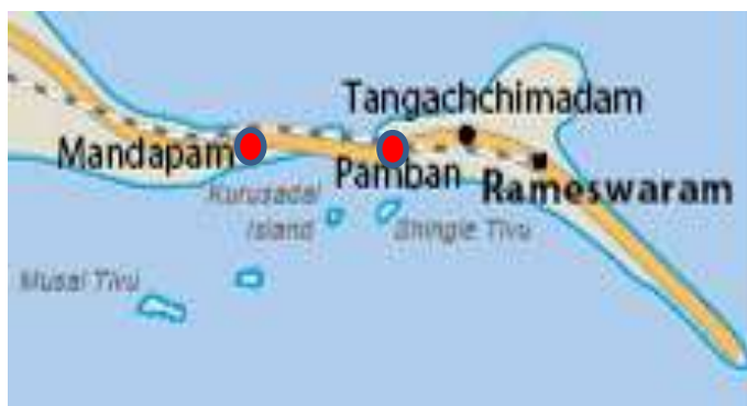
Plate: 3 Map showing the sample collection area

There is a good water spring situated inside the sea. A Sea Bridge connects Rameswaram on Pamban Island to Mandapam in Tamilnadu.