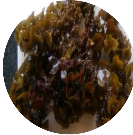
Plate: 5 Turbinaria ornate