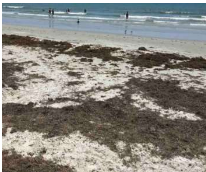
Plate: 4 Collection of Seaweeds from Mandapam beach

Rameswaram East coast of Tamilnadu, India. (Plate: 3). The live and healthy macro algal sample was collected by handpicking method at a depth of 1-2m during the month Dec 2020, from sandy beaches and irregularly distributed rocky substratum, of Mandapam beach and Pamban bridge of Rameswaram, Ramnad District, Tamilnadu, India.