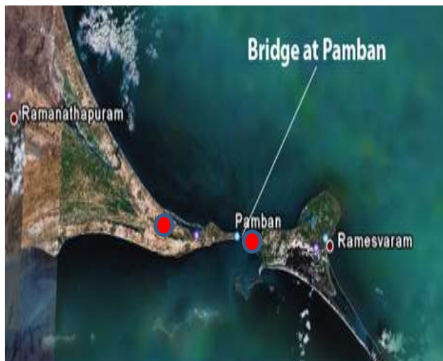
Plate: 2 Satellite map showing study area

Rameswaram is a town and a second grade municipality in the Ramanathapuram district in the South Indian state of Tamilnadu. It is island located on Pamban also known as Rameswaram Island, is connected to mainland India by the Pamban Bridge. Rameswaram is considered to be one of the holiest places in India and is the closest point from which to reach Srilankan India (The Hindu,2012).The town covers an area of 53km 2 (20sq mi) and had a population of 44,856 as of 2011.