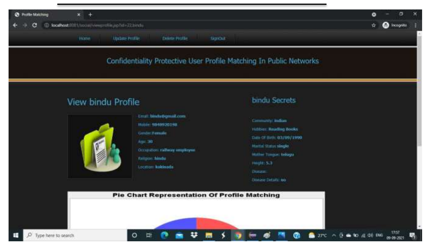
FIG 7. And if we like that profile we can view that profile and see further more details.