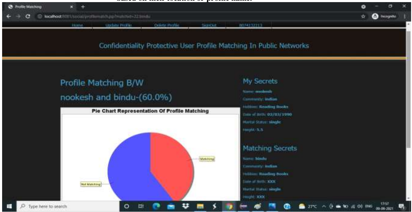
FIG 6. Now can find some profiles which are related to us . Then we can see either they have our matching interests or not and we can see the match percentage, if the percentage is above 50% then only we can see their interests or else we can't.