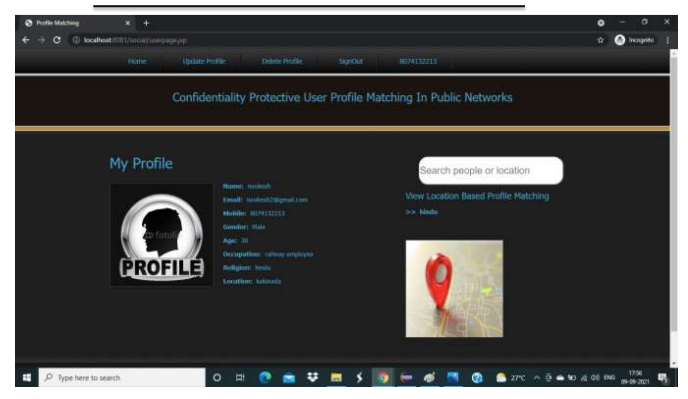
FIG 5. After completing your registeration we can see our profile and we can search our related profiles based on their location or profile name.