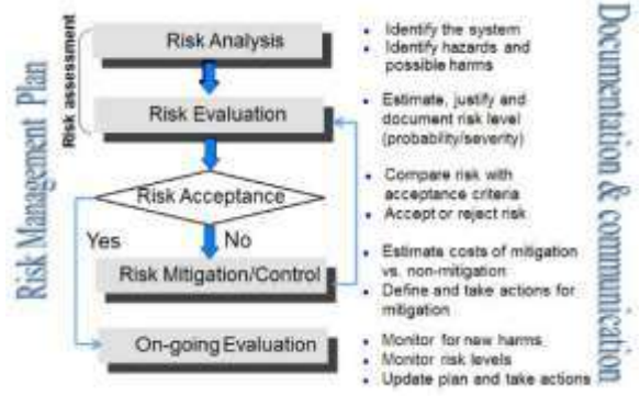
Fig 3.3 Risk Management plan