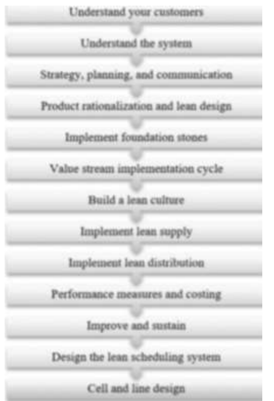
Fig.3.2-Hierarchical approach to lean implementation

production, just-in- time/perpetual flow production, lot size reductions, maintenance optimization, incipient processequipment/technologies, planning and scheduling strategies, preventive maintenance, process capability quantifications, pull system/Kanban, quality management programs, expeditious changeover techniques, reengineered production process, safety amelioration programs, self-directed work teams, total quality management.[3]