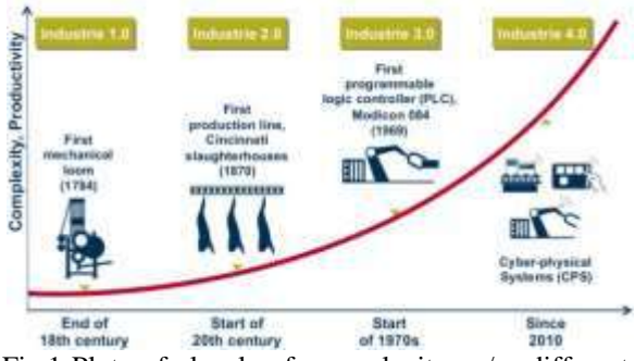
Industrie 4.0: The next Industrial Revolution

Fig.1-Plot of level of complexity v/s different centuries