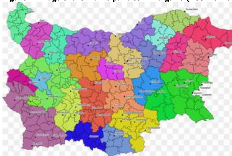
Figure 2. Image of the municipalities in Bulgaria (265 municipalities)

this sense, the purpose of this article is to show the chronology of administrative-territorial changes in recent years and how they affect the regional development of the national territory. Moreover, in the Bulgarian state tradition the municipality is the main administrative-territorial unit in which the local self-government in the Republic of Bulgaria is carried out. For example, only in the last 40-50 years in the country reforms have been carried out in the municipalities and until 1979 there were 1389 municipalities. After the large-scale administrative-territorial reform carried out in the period 1978-1979, the number of municipalities was reduced to 291. After the change, mainly affecting the municipalities, the dynamics of changes decreased significantly in the next reform (1989-1999), related to the introduction of 28 districts, the number of municipalities is 265.