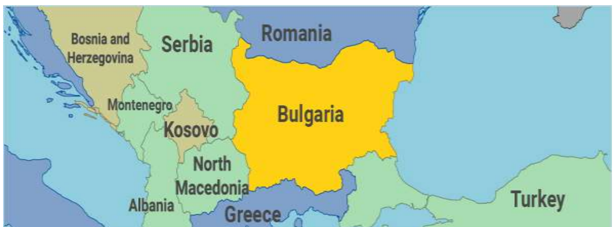
Figure 1. Geographical position of Bulgaria