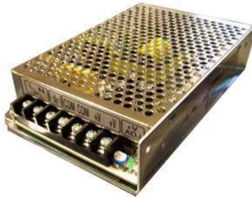
Fig: 3 Switch Mode Power Supply

is an electronic device and regulate the efficient power supply. In this work, Use of SMPS is for giving efficient power supply to motor.