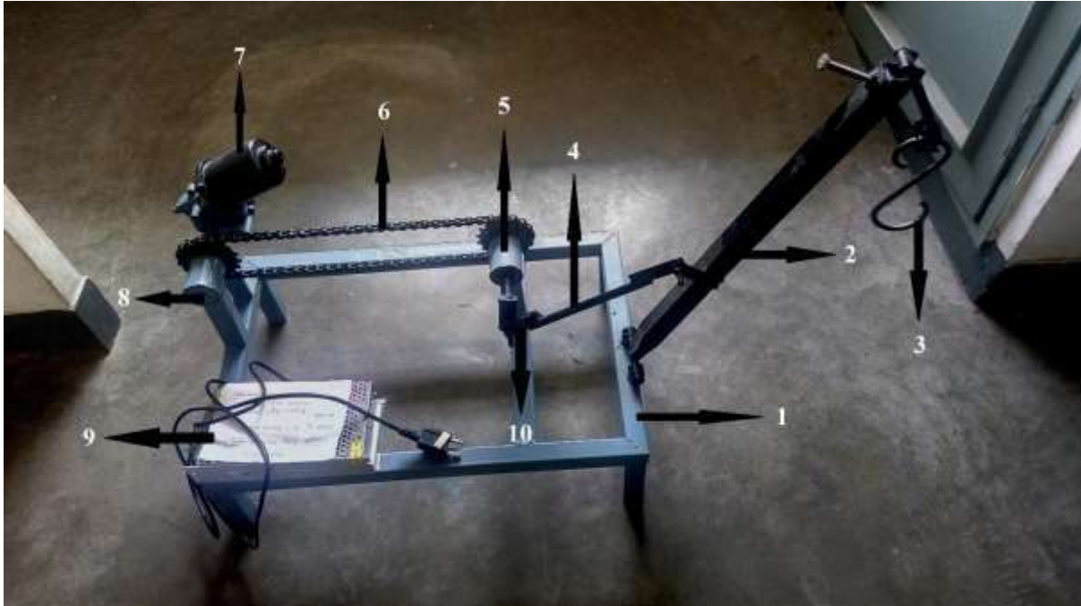
Fig 4: Automatic Cradle Swing Machine