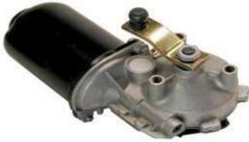
Fig: 2 wiper motor

Switch Mode Power Supply (SMPS): Switch mode power supply (also known as switching mode power supply or switched power supply or switcher)