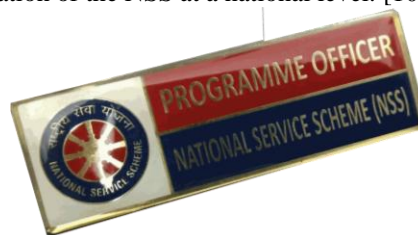
Figure 2: NSS Programme Officer

While the primary operational level of the NSS involves Programme Officers at the college/institution level, there can be individuals holding the title of "National Programme Officer" who play a crucial role in the broader organization and implementation of the NSS at a national level. [10]