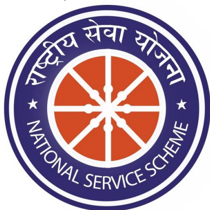
Figure 1: NSS Symbol